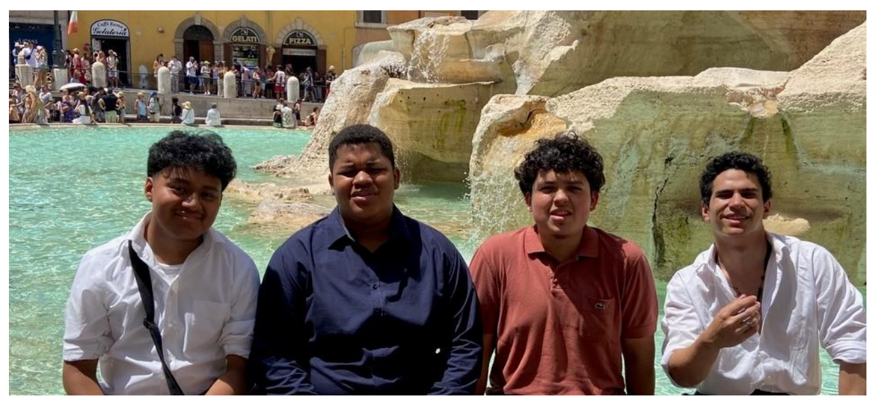
Our young parishioners in Rome, 2022