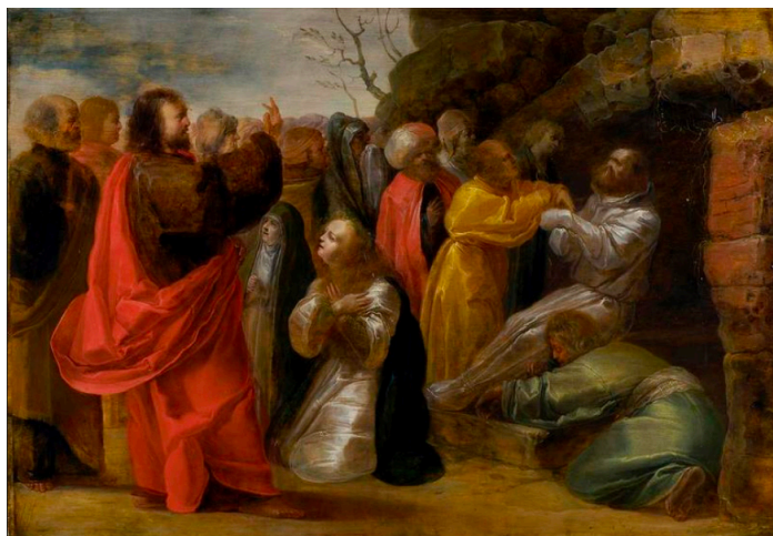
Jan van de Venne (fl. 1616–1651) The Raising of Lazarus between circa 1631 and circa 1651