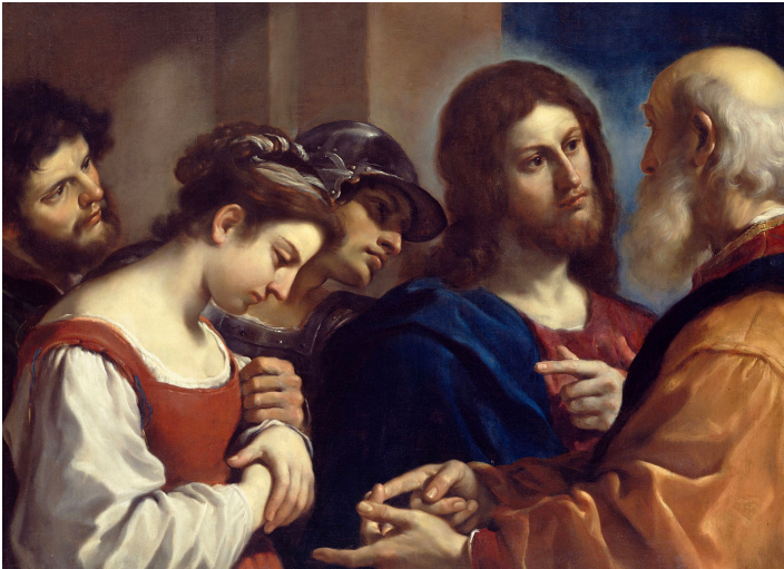
The Woman taken in Adultery Artist Guercino (1591-1666) oil on canvas